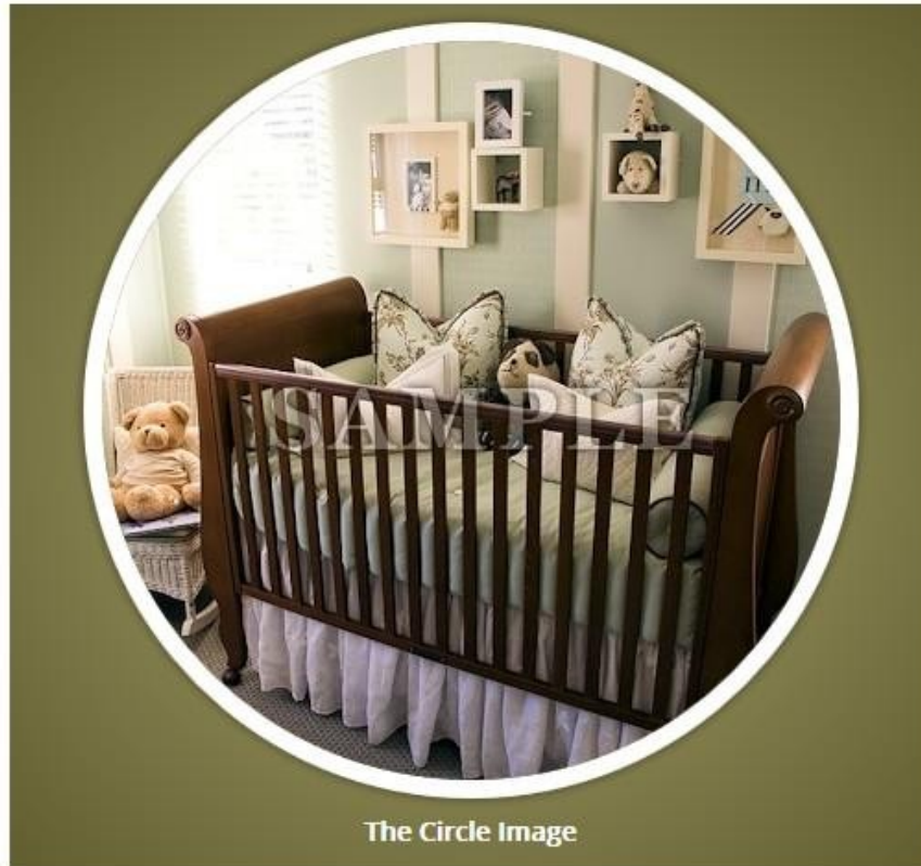
The Circle Image

shadow. Our image is 400px x 400px. Because we also want this image to contract in size on smaller devices, we first have to place the image into a <div> where we can control the width of the box.